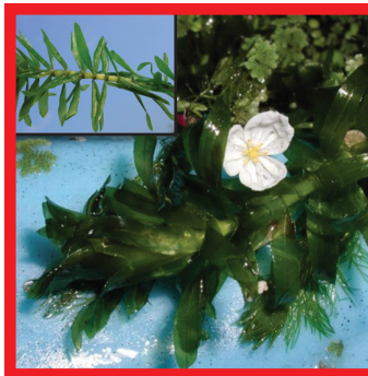
Brazilian waterweed ( Egeria densa )