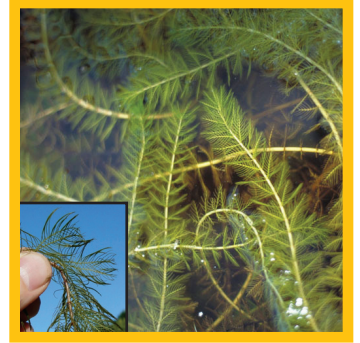
Eurasian water milfoil ( Myriophyllum spicatum )