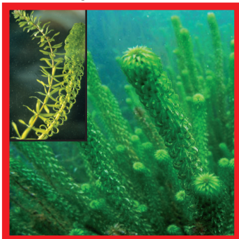
African elodea ( Lagarosiphon major )