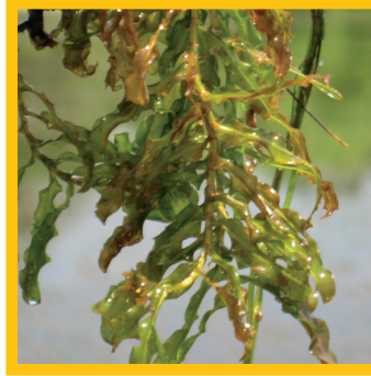
Curly-leaf pondweed ( Potamogeton crispus )