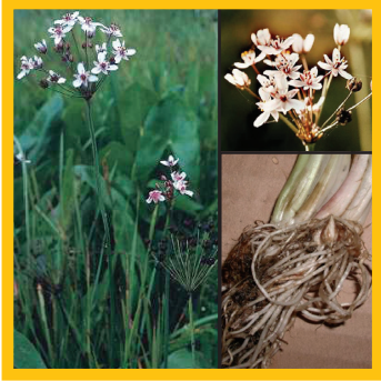
Flowering rush ( Butomus umbellatus )

http://dnr.wi.gov/invasives/aquatic/whattodo/