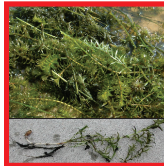
Hydrilla ( Hydrilla verticillata )