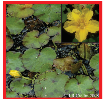
Yellow floating heart ( Nymphoides peltata )