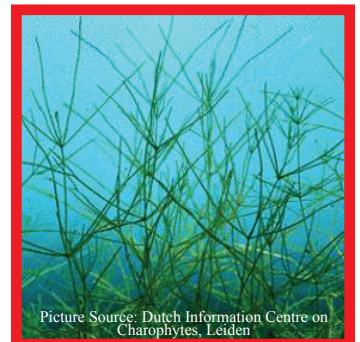
Starry stonewort (alga) ( Nitellopsis obtusa )