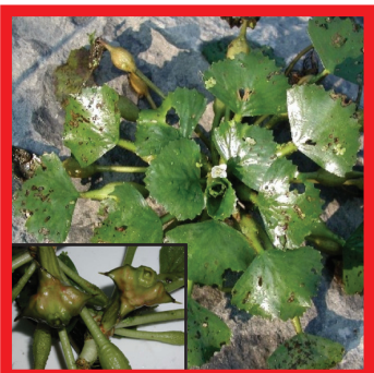
Water chestnut ( Trapa natans )