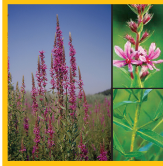
Purple loosestrife ( Lythrum salicaria )