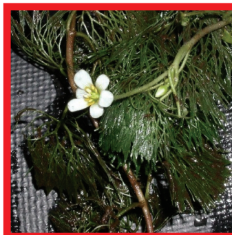
Fanwort ( Cabomba caroliniana )