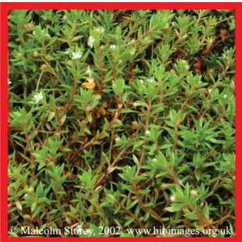
Australian swamp stonecrop ( Crassula helmsii )