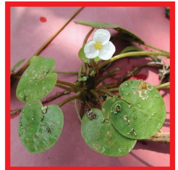
European frog-bit ( Hydrocharis morsus-ranae )