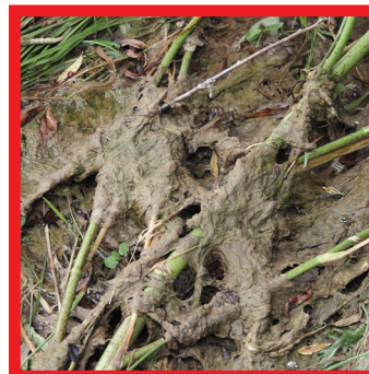
Didymo or rock snot (alga) ( Didymosphenia geminata )