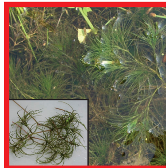
Brittle water nymph ( Najas minor )