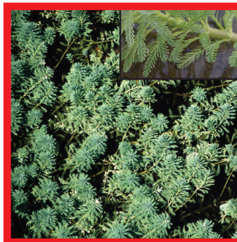
Parrot feather ( Myriophyllum aquaticum )